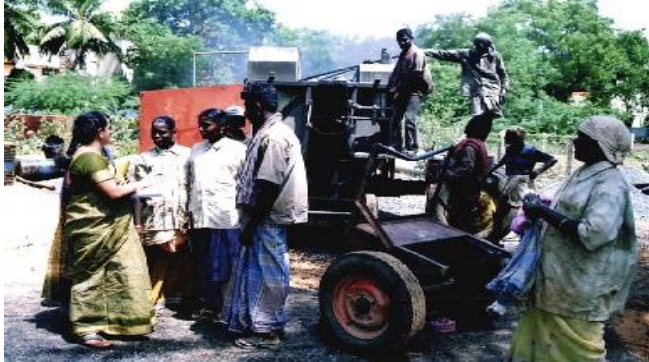
Plate 1. Examination of Health status among Road workers